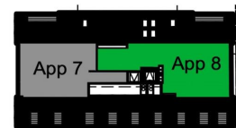
ETAGE +3 / COMBLES